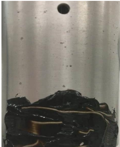
Figure 3. Sleeve covered with tar oil.