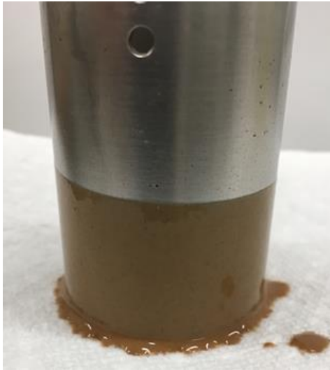
Figure 1. Sleeve dipped in OBM for 1 min

FinoCLEAN X effectively removed all oil-based mud or tar oil present on the sleeve (Figures 1 through 4). The fluid showed a cleaning efficiency of 100%. Viscometer sleeve used as matrix.